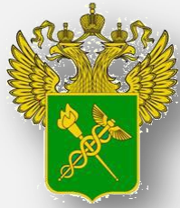
Federal Customs Service of the Russian Federation