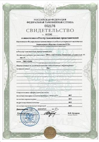
VTN-Agency, JSC License of customs representative (broker) N 0152/02